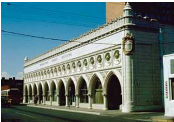
Glazed architectural terra-cotta was a practical and highly decorative building material.

Ceramic veneer was developed during the 1930s and is still used extensively in building construction today. Unlike traditional architectural terra-cotta, ceramic veneer is not hollow cast, but is as its name implies: a veneer of glazed ceramic tile which is ribbed on the back in much the same fashion as bathroom tile. Ceramic veneer is frequently attached to a grid of metal ties which has been anchored to the building.