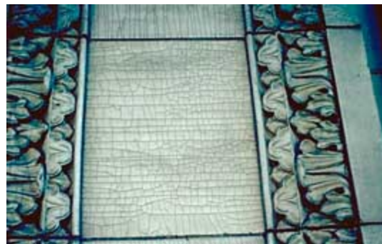
Water and air-borne moisture entering the glazed architectural terra-cotta causes expansion of the porous clay body, increasing its volume. This upsets the "fit" of the glaze and makes its surface shatter, which is commonly called "crazing."

Crazing , or the formation of small random cracks in the glaze, is a common form of water-related deterioration in glazed architectural terra-cotta. When the new terra-cotta unit first comes from the kiln after firing, it has shrunk (dried) to its smallest possible size. With the passage of time, however, it expands as it absorbs moisture from the air, a process which may continue for many years. The glaze then goes into tension because it has a lesser capacity for expansion than the porous tile body; it no longer "fits" the expanding unit onto which it was originally fired. If the strength of the glaze is exceeded, it will crack (craze). Crazing is a process not unlike the random hairline cracking on the surface of an old oil painting. Both may occur as a normal process in the aging of the material. Unless the cracks visibly extend into the porous tile body beneath the glaze, crazing should not be regarded as highly serious material failure. It does, however, tend to increase the water absorption capability of the glazed architectural terra-cotta unit.