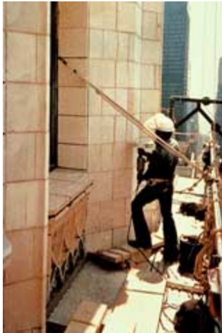
A worker cleans out mortar joints in preparation for repointing the architectural terra-cotta

In an effort to stem water-related deterioration, architects and building owners often erroneously attribute water-related damage to glaze crazing when the source of the deterioration is, in fact, elsewhere: deteriorated caulking, flashing, etc. The waterproof coating of glazed architectural terra-cotta walls may cause problems on its own. Outward migration of water vapor normally occurs through the mortar joints in these systems. The inadvertent sealing of these joints in the wholesale coating of the wall may exacerbate an already serious situation. Spalling of the glaze, mortar, or porous body will, more than likely, result.