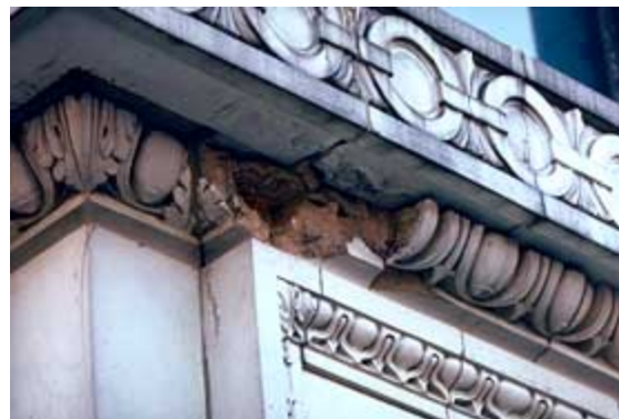
Material spalling is the result of excessive expansion of the porous tile body caused by water and freezing temperatures. This is a

There are some methods of internal and external inspection and analysis which are relatively simple to the trained professional. Other methods, however, are expensive, time