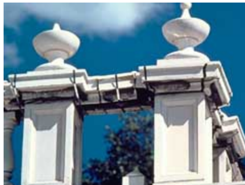
Exposed or freestanding terra-cotta detailing (parapets, urns, balusters, etc.) have traditionally been subjected to the most severe vicissitudes of deterioration as a result of freezing temperatures and water.

Deterioration in glazed architectural terra-cotta is, by definition, insidious in that the outward signs of decay do not always indicate the more serious problems within. It is, therefore, of paramount importance that the repair and replacement of deteriorated glazed architectural terra-cotta not be undertaken unless the causes of that deterioration have been determined and repaired. As mentioned before, one of the primary agents of deterioration in glazed architectural terra-cotta is water. Therefore, water-related damage can be repaired only when the sources of that water have been eliminated. Repointing, caulking and replacement of missing masonry pieces are also of primary concern. Where detailing to conduct water in the original design has been insufficient, the installation of new flashing or weep holes might be considered.