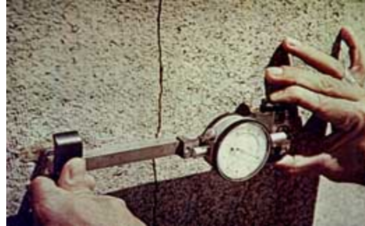
This crack is being measured. Structural cracking, whether static (nonmoving) or dynamic (moving) should be caulked to prevent water entry into the glazed architectural terra-cotta system.

however, important to remember that these waterproof caulking compounds are not viable repointing materials and should not be used as such.