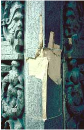
The damage shown here is the result of direct live load on a mid-rise building. The steel frame has settled and shifted the weight onto the exterior terra-cotta cladding, resulting in rupturing of the material.