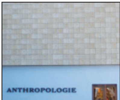
Anthropologie • GRC Rain Screen

Stromberg GFRC is a composite of high-strength concrete and glass fibers, which can be factory molded into virtually any size or shape.