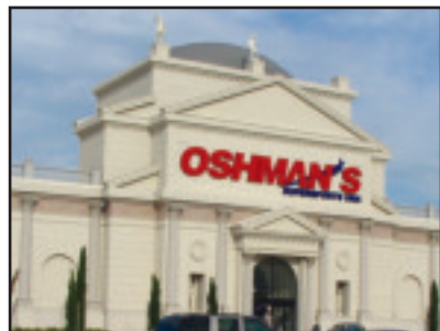
Portofino • GRC Columns, Panels, Medallions • Surrounds

Most projects are custom. Comprehensive shop drawings show shapes and dimensions and indicate layout and fastening methods.