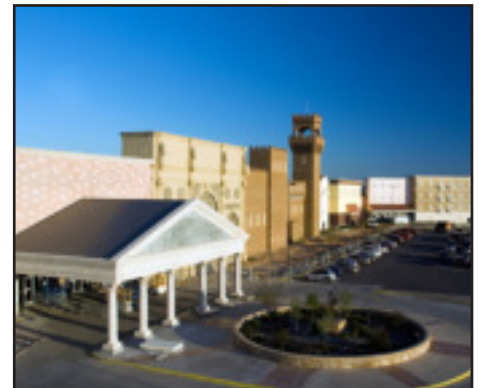
Winstar World Casino • GRC Wall Panel System

Manufactured by Stromberg Architectural Products 4400 Oneal Street Greenville, Texas 75401