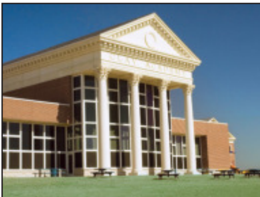
Clay Academy • GRC Columns